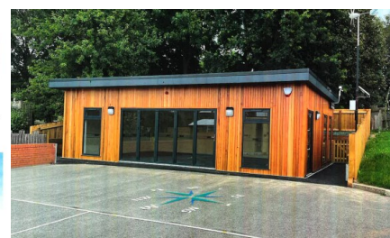
Example Modular Building

We are delighted to say we have been successful in bidding for our BRAND NEW EYFS Building. The building work is due to start during half term. So this means there will have to be a few changes to help this go smoothly and we would be grateful for your cooperation. The usual gates will be out of action for a while (for the safety of parents and pupils). The way in will now be via the gate at end of car park close to Y3/5 until further notice. Car park gates will be shut at 8:30am for increased safety. KS2 Parents are to drop pupils at the pedestrian gate next to car park, KS1 and EYFS parents can walk through with the children. There will be a member of staff near main gates and placed along the footpath to keep our pupils safe. The end of the day parents will be able to collect from class/cloakrooms as normal using the Y3/5 gate. Car park gates will remain shut until 3.30pm. Breakfast club will need to come in via the office only.