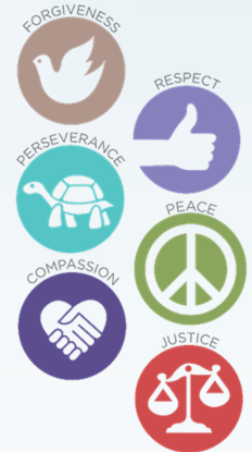
Our School Values