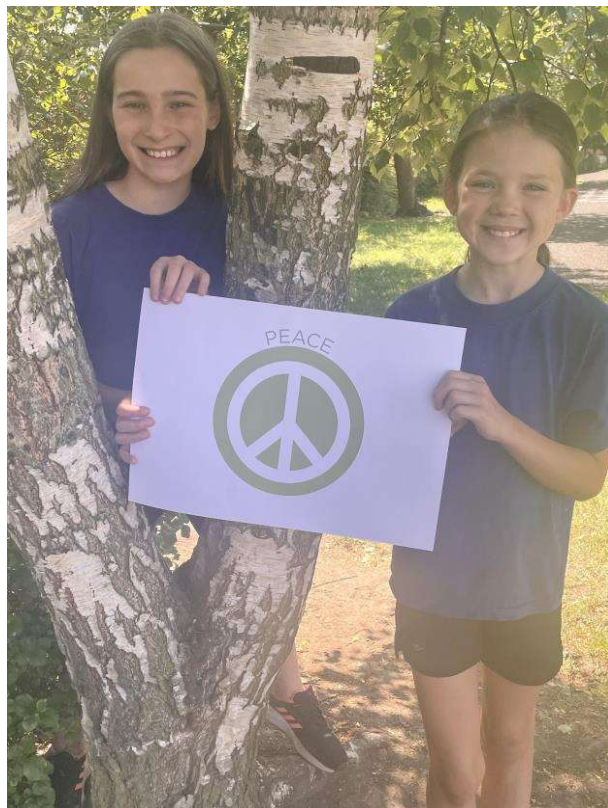
2 - Peace