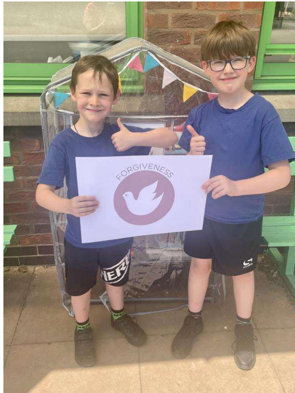
3 - Forgiveness