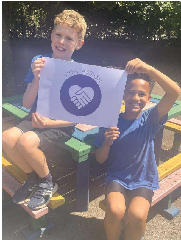
1 - Compassion